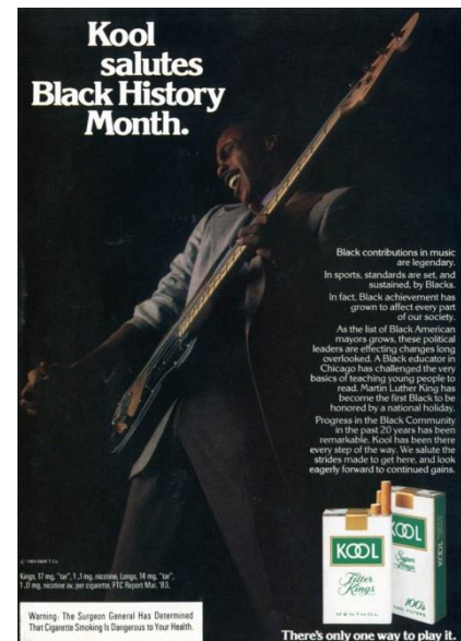
Kool advertisement, 1984

The tobacco companies developed specific strategies and specially designed product displays to adapt their point-of-sale marketing to smaller retailers that were more common in cities. Philip Morris implemented promotional programs and paid retailers to exhibit product displays and grow their inventory. Brown & Williamson launched its Kool Inner City Point of Purchase Program, later the Kool Inner City