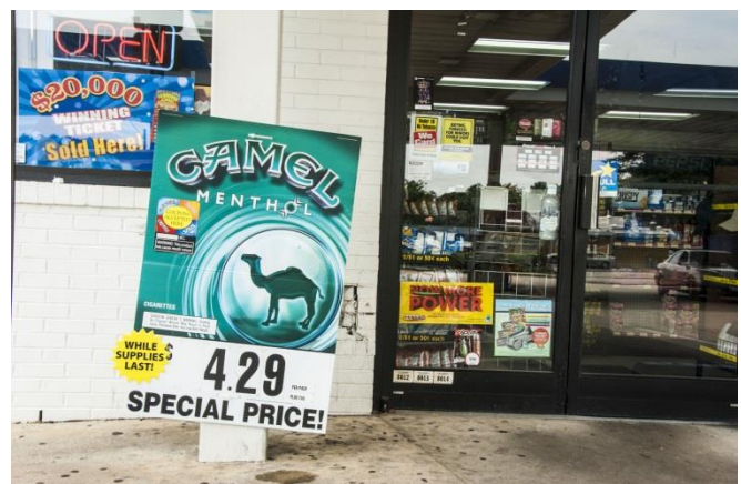
Price promotions for Camel cigarettes in Durham, NC.

Tobacco companies have taken advantage of the greater density of convenience stores and gas stations in lower-income and minority neighborhoods to heavily market and promote tobacco products. The 2024 Surgeon General’s Report concluded that, “Tobacco marketing in general and marketing for menthol cigarettes in particular are more prevalent in neighborhoods with greater percentages of African American residents or of residents with lower incomes compared with neighborhoods with lower percentages of African American residents or of residents with higher incomes.” 28 Their marketing strategies have included price discounts, promotional giveaways, heavy product placement and culturally tailored ad content at retail locations, both indoors and out. A wealth of research indicates