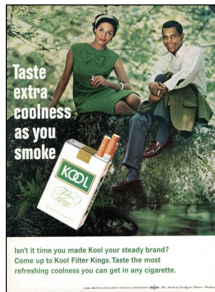
Kool advertisement, 1966

The marketing of menthol cigarettes to the Black community dates back to at least the 1950s. Salem led the menthol market in the 1950s and 1960s and is credited with establishing a popular market for menthols (menthols were initially a specialty cigarette, marketed for reducing throat irritability), but Kool overtook Salem in popularity in 1972. 7 Brown & Williamson began targeting Black Americans with Kool cigarettes after a 1953 survey showed that five percent of Black Americans preferred Kool compared to two percent of White Americans. Brown & Williamson * seized the opportunity to capitalize upon this small preference margin, recognizing the marketing advantage of appealing to a newly urbanized and more concentrated population. 8 The establishment of popular magazines like Ebony and Jet also provided marketing venues that had not previously existed for reaching Black Americans.